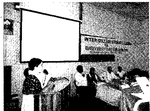
Inter-College Students' Seminar