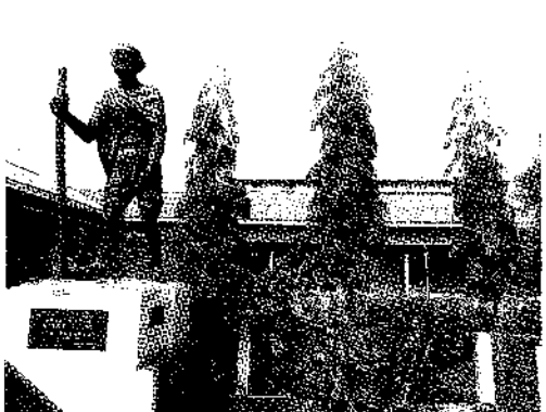
Statue of Mahatma Gandhi